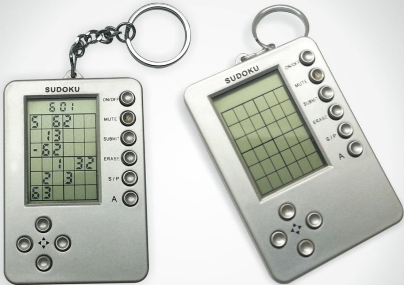
Mini Sudoku game with Key Ring- P 03